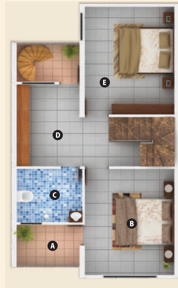
20'x40' Duplex Floor Plan